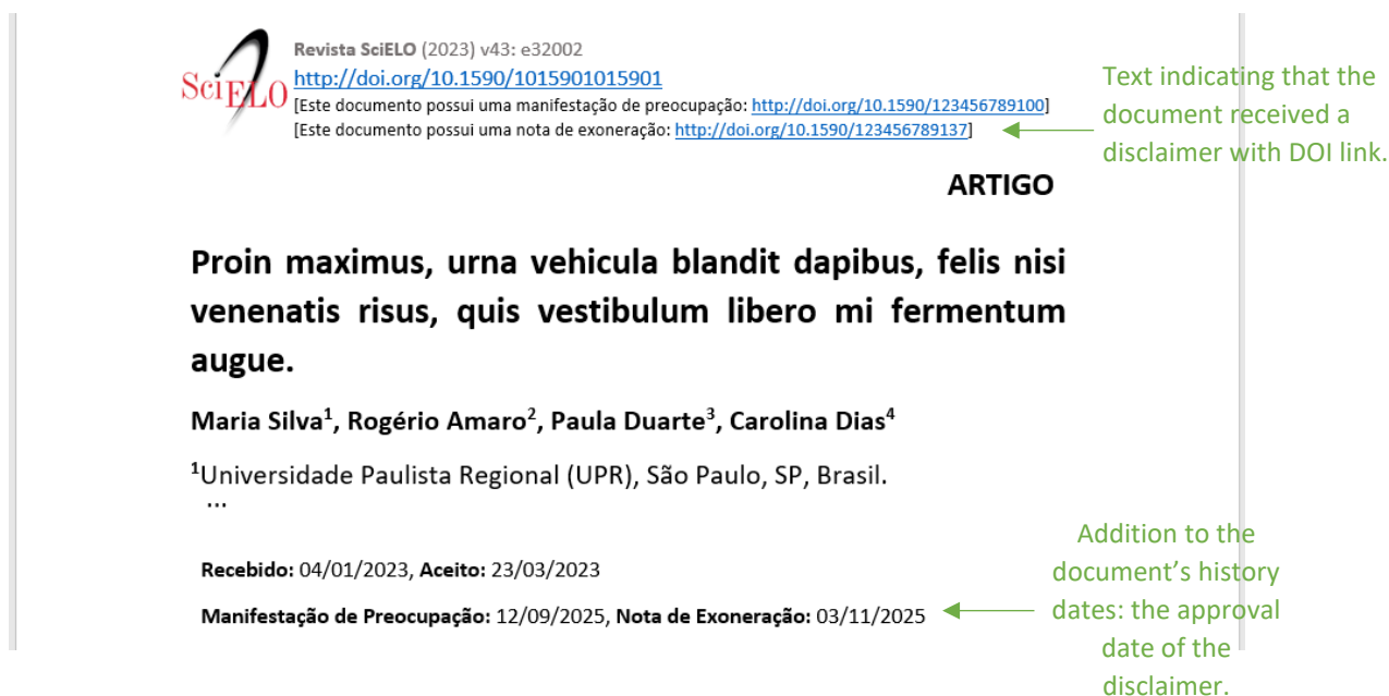
Figure 4: Addition of text with disclaimer link + history date in the PDF of the document that received a disclaimer

For more information, consult Display guidelines for Crossref DOIs , item How to display a Crossref link and Guidance for creating a DOI (Portuguese only).