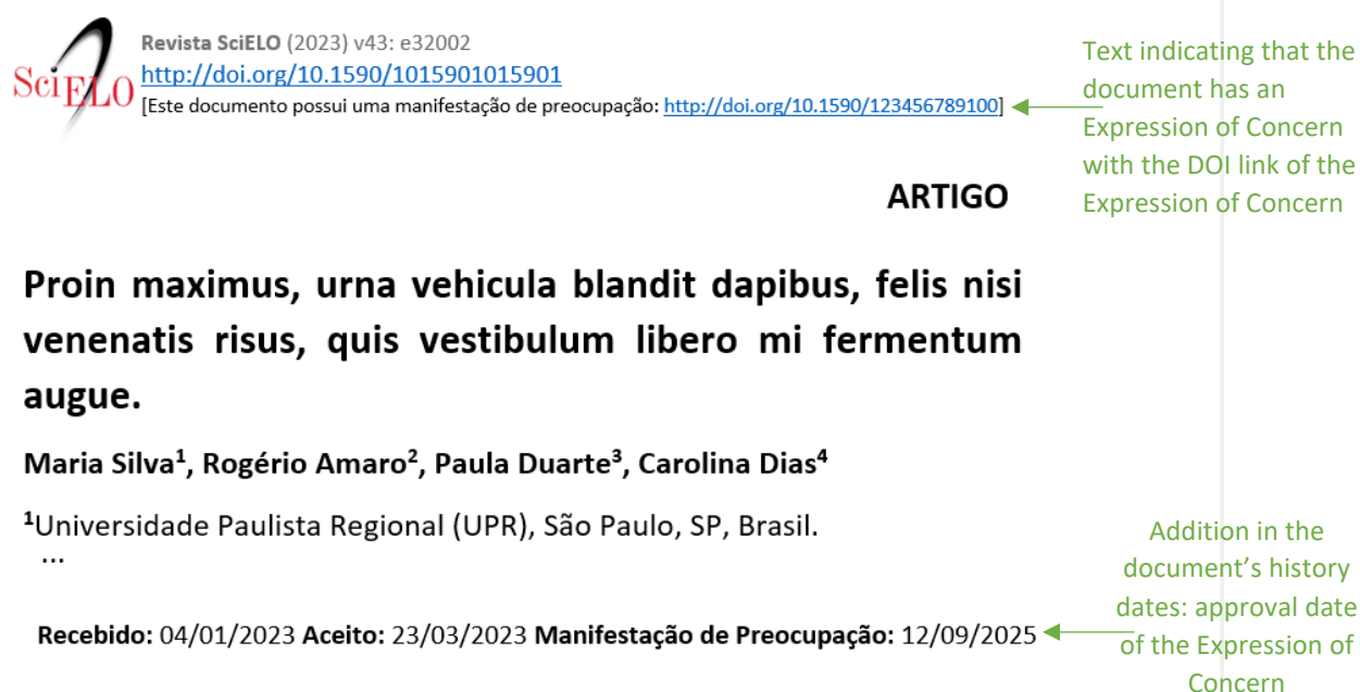
Figure 2: Addition of text with Expression of Concern link + history date in the PDF of the document subject to the Expression of Concern

For more information, consult Display guidelines for Crossref DOIs , item How to display a Crossref link and Guidance for creating a DOI (Portuguese only).